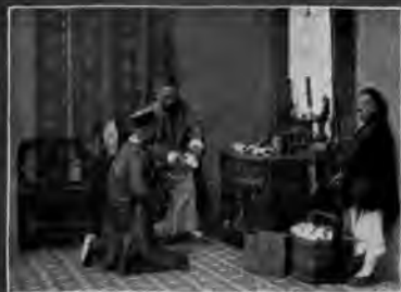
WORSHIPPING AT THE FAMILY ALTAR